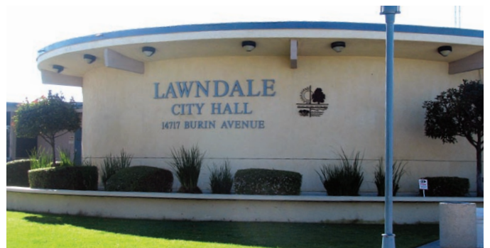
Lawndale City Hall