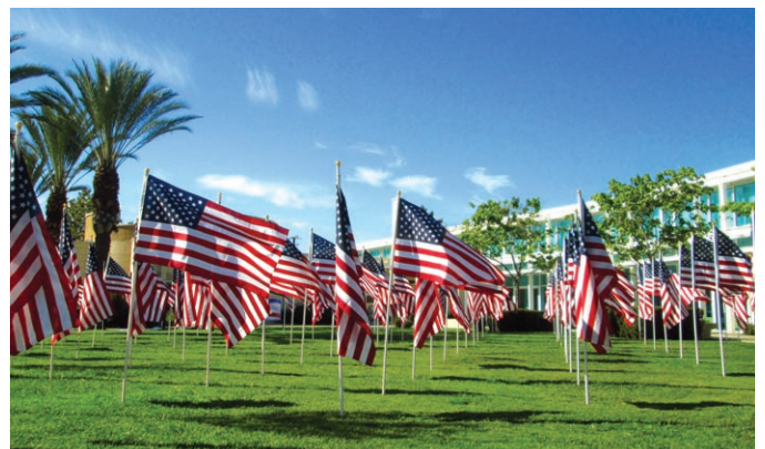
Lawndale Field of Honor, Honoring Veterans

The Lawndalian newsletter is a publication mailed to all Lawndale resident and business addresses in August (Fall Issue) and February (Spring Issue) of each year in addition to being made available online. In May (Summer Issue) and November (Winter Issue) of each year, the Lawndalian online edition will include new articles , new classes and will be accessible from the City's website at www.lawndalecity.org .